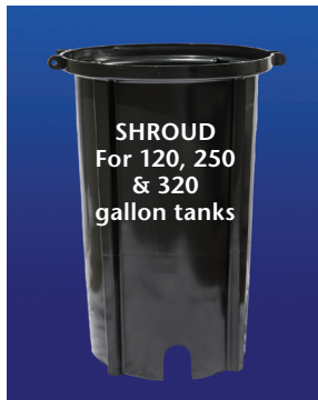
SHROUD For 120, 250 & 320 gallon tanks