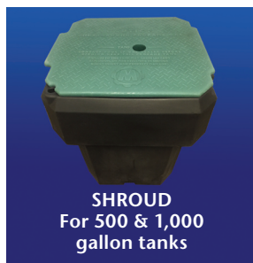
SHROUD For 500 & 1,000 gallon tanks